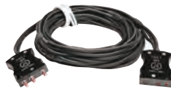
Type 5001301 25 FT. 100 Amp Extension Cable