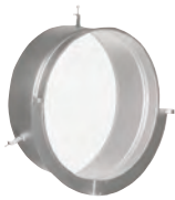
Type 24637 Diffuser Holder with Type 34717 Safety Screen