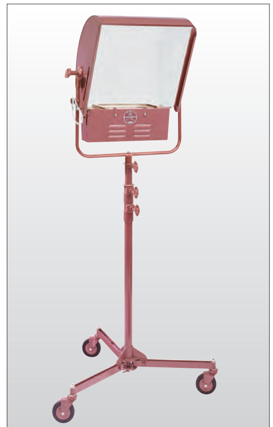
TYPE 2551 MOLEQUARTZ® SUPER-SOFTLIGHT MOUNTED ON TYPE 410138 JUNIOR SIZE STANDARD STAND

Provides soft, diffused virtually shadowless light with smooth field. Used for soft fill in Commercial Photography of products where shadows must be at a minimum. Also used in Motion Picture and Television Studios where shadows must be "washed out". Designed so that all the light comes indirect and unobstructed from diffuse surfaces through a relatively large aperture. Uses 1,000 watt 3200°K quartz globe. Equipped with safety screen.