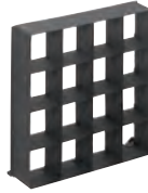
Type 3575 Egg Crate