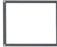
Type 25730 Diffuser Frame