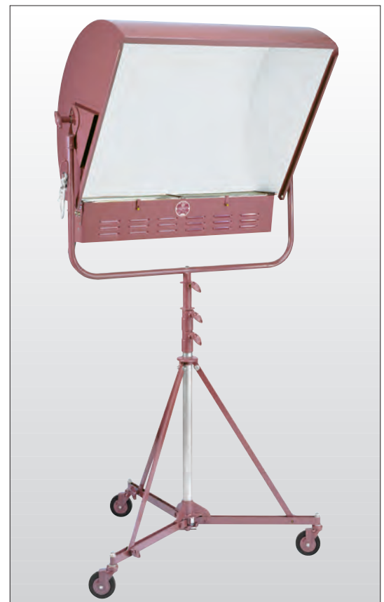
TYPE 2571 MOLEQUARTZ® SUPER-SOFTLIGHT MOUNTED ON TYPE 41494 SENIOR SIZE STANDARD STAND

Provides soft, diffused virtually shadowless light with smooth field. Used for soft fill in Commercial Photography of products where shadows must be at a minimum. Also used in Motion Picture and Television Studios where shadows must be "washed out". Designed so that all the light comes indirect and unobstructed from diffuse surfaces through a relatively large aperture. Uses four 1,000 watt 3200°K quartz globes. Four switches control light intensity. Equipped with safety screen.