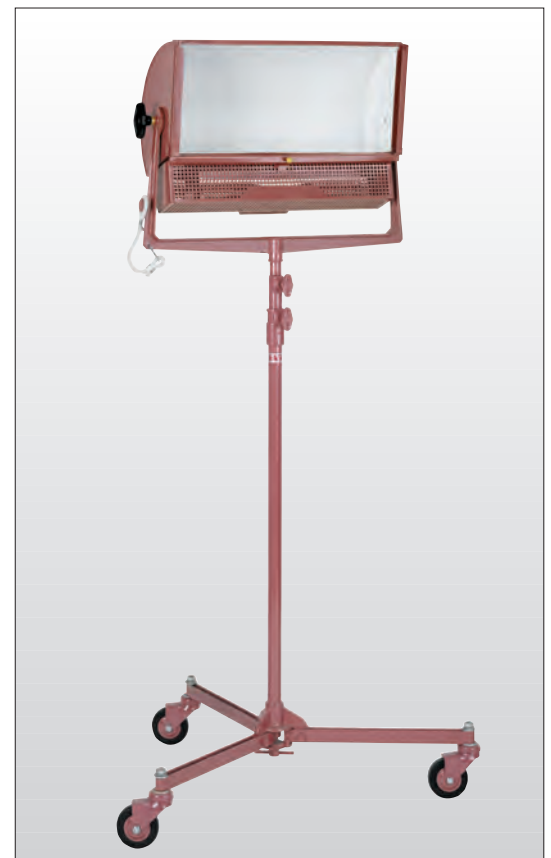
TYPE 2591 MOLEQUARTZ® 2K BABY "ZIP®" SOFTLIGHT MOUNTED ON TYPE 40651A BABY SIZE STANDARD STAND

Designed to fill the need for a small compact Softlight with high performance for locations and small sets where space is at a minimum. All the light comes indirect and unobstructed from diffuse surfaces. For use with two 1,000 watt 3200°K quartz globes. Two switches control light intensity. Equipped with safety screen.