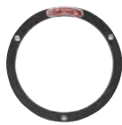
Type 28050 Moledisc Diffuser Frame