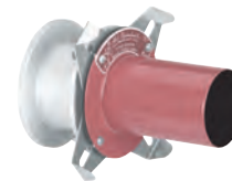
Type 280108 Focal Spot