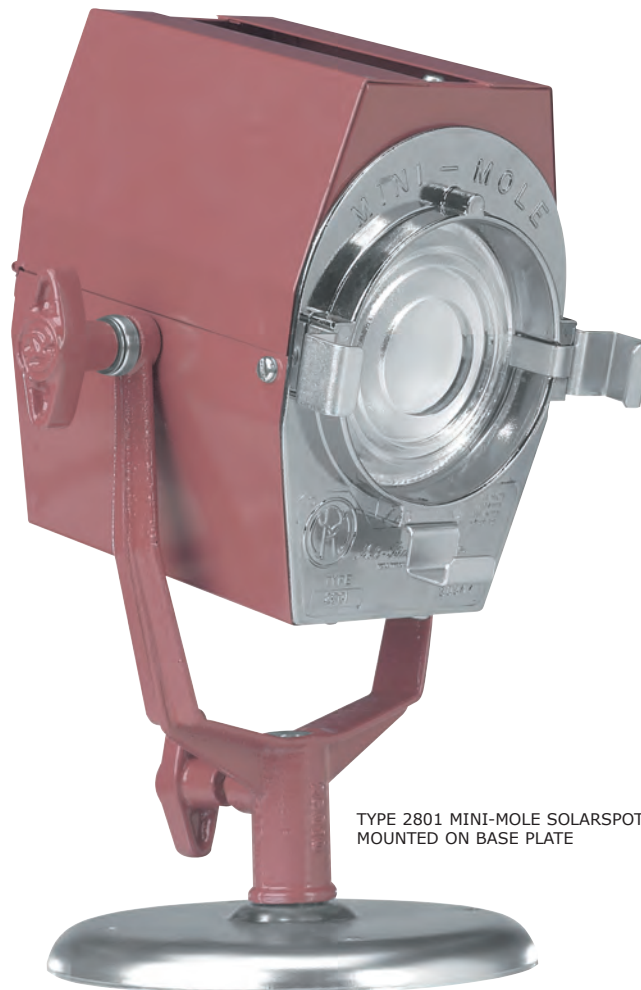
TYPE 2801 MINI-MOLE SOLARSPOT® MOUNTED ON BASE PLATE