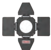
Type 2904 4-Way Light Shield

The Type 2801 Mini-Mole can be equipped with larger diffuser clips to handle 5⅞" diffusion retainers. See Type 2351, Type 4821 and Type 3131 bulletins for accessory ordering code number.