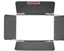
Type 29174 4-Way Light Shield