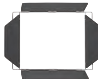
Type 2924 4-Way Light Shield