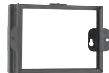
Type 29194 Accessory Holder