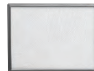
Type 2928S Single Moledura Scrim