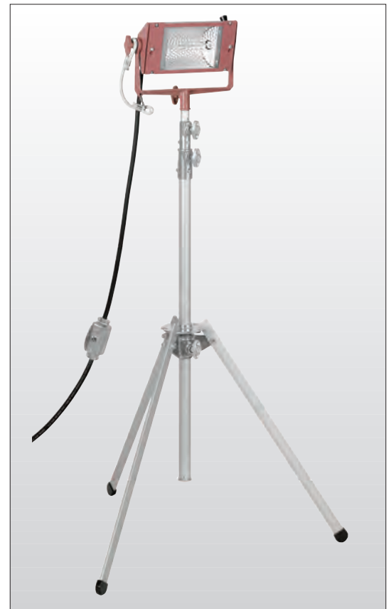
TYPE 2921 MOLEQUARTZ® NOOKLITE MOUNTED ON TYPE 2541 COMPACT LITEWATE BABY SIZE STAND

Primarily designed to fit into wall corners, small nooks or on ceilings, the unit has literally dozens of other applications where lighting in tight or confined areas presents a problem. Equipped with safety screen.