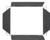
Type 2924 4-Way Light Shield

Globes not included in price of lamp. See price list for complete details.