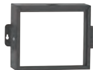
Type 2925 Accessory Holder