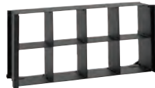
Type 2595 Egg Crate