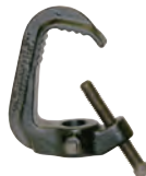
Type 1201 C-Clamp