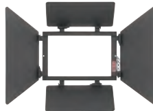
Type 32124 4-Leaf Light Shield

(See Stand Section for more information & options)