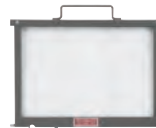
Type 3214 Glass Diffuser Frame Assembly