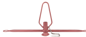
Type 42596 Trapeze