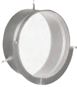
Type 24637 Diffuser Holder with Type 34717 Safety Screen