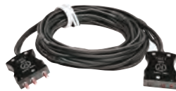
Type 5001301 25 FT. 100 Amp Extension Cable