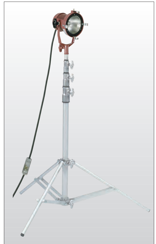
TYPE 4031 MOLEQUARTZ® TEENIE-WEENIE MOLE MOUNTED ON TYPE 3631 LITEWATE KIT STAND

A compact, focusable tungsten-halogen quartz fixture designed especially for the traveling cameraman. For use with 600 watt, 120 volt quartz globe or 250 watt, 30 volt quartz globe with a 30 volt battery pack. Extremely smooth, flat field in all positions from spot-to-flood. Fixture may be mounted on stand or camera, or hand held. For use in TV news coverage, and TV Film commercials as well as Motion Picture and Industrial film. Available in Kits for ease in transportation by car, bus, truck or airplane. Equipped with Safety Screen.