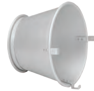
Type 5316 Snoot and Diffuser Holder