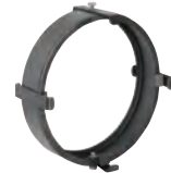
Type 5055 Accessory Holder