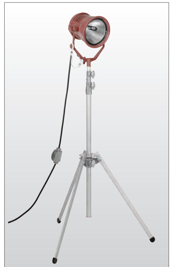
TYPE 4081 MOLEQUARTZ® MICKEY-MOLE MOUNTED ON TYPE 2541 COMPACT LITEWATE BABY SIZE STAND

Compact, focusable tungsten-halogen quartz fixture provides high intensity in a small package. For use in TV news coverage, and TV Film commercials as well as Motion Picture and Industrial films. Excellent for use in small TV studios or stages in schools and universities. Available in kits for ease in transporting by car, truck, or airplane. Extremely smooth, flat field in all positions from spot-to-flood. Uses special Aluminum Molebrite® Alzak Reflector. For use with 1,000 watt, 3200°K quartz globe. Equipped with safety screen.