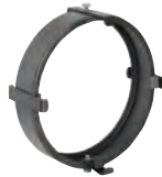
Type 4085 Accessory Holder