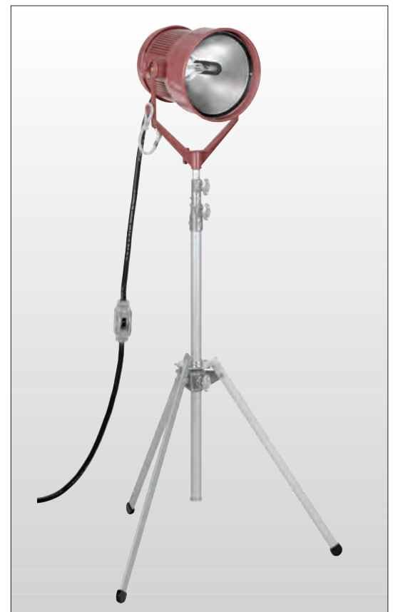
TYPE 4091 MOLEQUARTZ® MIGHTY-MOLE MOUNTED ON TYPE 2541 COMPACT LITEWATE BABY SIZE STAND

Compact, focusable tungsten-halogen quartz fixture provides high intensity in a small package. For use in TV news coverage, and TV Film commercials as well as Motion Picture and Industrial films. Excellent for use in small TV studios or stages in schools and universities. Available in kits for ease in transporting by car, truck, or airplane. Extremely smooth, flat field in all positions from spot-to-flood. Uses special Aluminum Molebrite® Alzak Reflector. For use with 2,000 watt, 3200°K quartz globe. Equipped with safety screen.