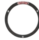
Type 41245A Moledisc Diffuser Frame