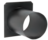
Type 40913 Snoot