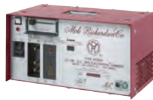
Type 42590 12K A.C. DMX Molelectronic Dimmer (120V)