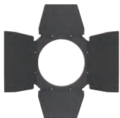
Type 680175 4-Way Light Shield

Globes not included in price of lamp. See price list for complete details.