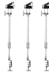
Type 635187 Extension Arm (Set of 3)