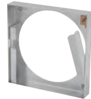
Type 55416 Globe Retainer