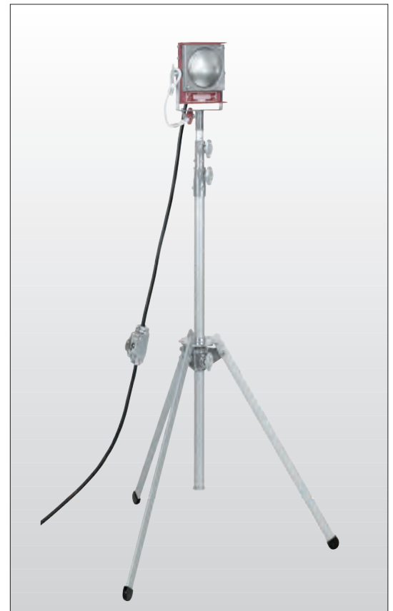
TYPE 5711 MOLEQUARTZ® MOLEFAY® MOUNTED ON TYPE 2541 COMPACT LITEWATE BABY SIZE STAND

Designed for daylight booster when using the quartz tungsten-halogen Dichroic FAY globes. Lightweight and compact. Ideal for exterior fill-light and for hard-to-get-to or confined areas. By directing this lamp through a windshield or window, boosting of daylight can be achieved. Globe held in a unique globe retainer which mounts directly to the module. Equally as useful indoors or at night when used with 3200°K quartz globe.