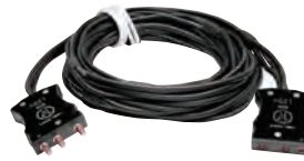
Type 5001301 25 FT. 100 Amp Extension Cable