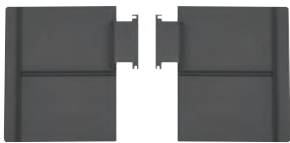
Type 5779 2-Leaf Light Shield and Diffuser Holder (pair)

Globes not included in price of lamp. See price list for complete details. ETL Listed *220 Volt Globe Available.