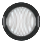
Type 66251 Medium Lens