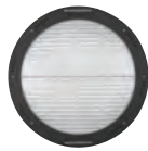
Type 66578 Medium Lens