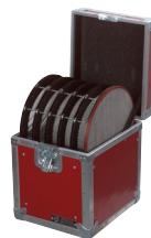
Type 663105 Lens Case (Shown with Lenses, Fresnel & Scrim)