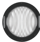
Type 66357 Medium Lens