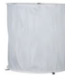
Type 72711 Silk Skirt