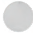
Type 72712 Silk Target