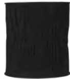
Type 72710 Black Skirt

Globes not included in price of lamp. See price list for complete details.