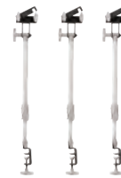
Type 635187 Extension Arms (Set of 3)