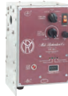
Type 6611 DMX Shutter Motor