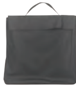
Type G140 Scrim Bag