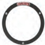
Type 41699A Moledisc Diffuser Frame