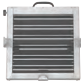
Type 518 Shutter