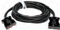
Type 5001301 100 Amp Cable Extension—25 ft.