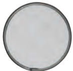
Type 450763D Double Moledura Scrim