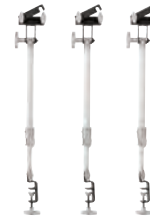
Type 635187 Extension Arms (Set of 3)