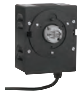
Front View Type 8481

*The average color temperature decrease during life is .5°K-10°K per hour of operation. Globes not included in price of lamp. See price list for complete details.