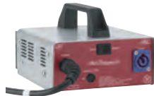
Type 82833 SquareWave Ballast