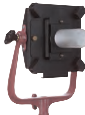
Type 84830 MoleSource Adapter