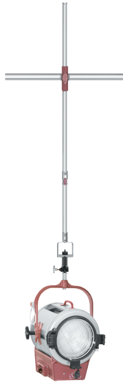
Adjustable Hanger and Type 500429 Stirrup, with 500353 Heavy Duty C-Clamp and Adapter, suspending Type 4191 Baby Senior Solarspot ®