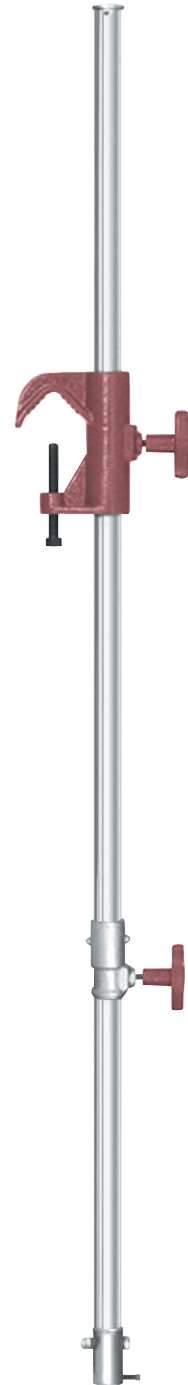
TYPE 500424 TELESCOPING HANGER