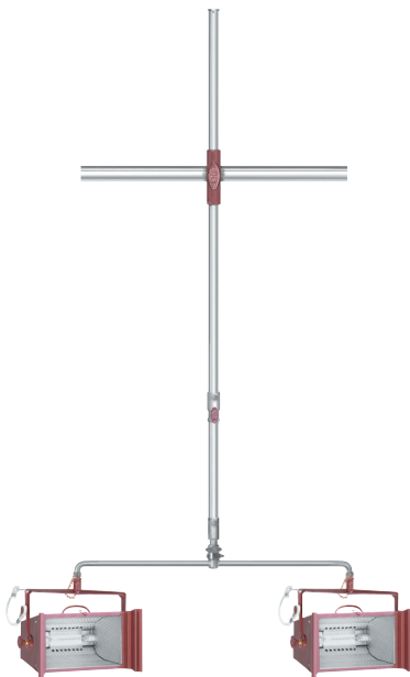
Telescoping Hanger and Type 500411 Double Hanger suspending two Type 3211 Molequartz® Broads

A streamlined and rugged hanger available in a variety of lengths for hanging Scoops, Broads or Spots in TV Studios or other pipe hung applications. Easily adjustable from minimum to maximum length from pipe grid. A variety of adapters are available for hanging fixtures one at a time or in multiple.