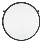
Type 24549 Safety Screen