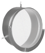
Type 24552 (Type 24515 Diffuser Holder and Type 24549 Safety Screen in one assembly)