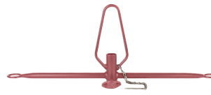
Type 500305 Trapeze