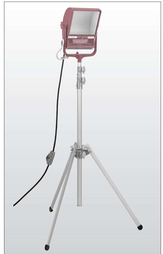
TYPE 2981 MOLEQUARTZ® MINI-SOFTLIGHT MOUNTED ON TYPE 2541 COMPACT LITEWATE STAND

This small Mini-Softlite provides soft, diffused, virtually shadowless light with a smooth field. For use in confined, close-up areas, and may also be mounted on Motion Picture or Television cameras as a front fill-light. Designed so that all the light comes indirect and unobstructed from diffuse surfaces. Uses 650 watt FAD 3200°K quartz globe. Equipped with safety screen.