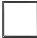
Type 29830 Diffuser Frame