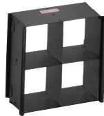
Type 2985 Egg Crate

Globes not included in price of lamp. See price list for complete details.